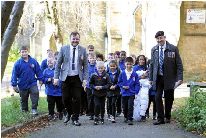
Photo 2: Staff and Residents from Avondale House, together with our partners and the children of Byker Community Primary School.